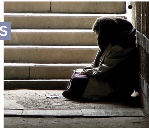
This talk corresponds with Tour 2—Homeless in Chicago: Not By Choice on Tuesday, September 26 or Wednesday, September 27.