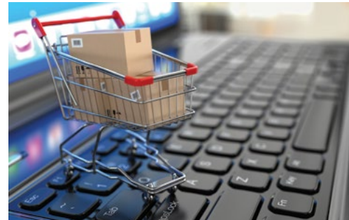
This talk corresponds with Tour 5—The Business of Retail: Bricks, Clicks, Today's New Mix on Wednesday, November 1 or Thursday, November 2.