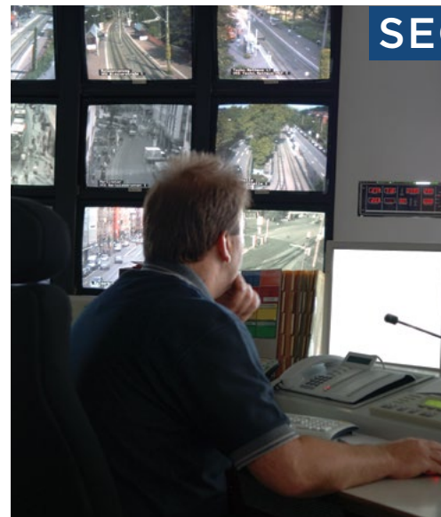
This talk corresponds with Tour 4—They've Got Your Back: Planning for Catastrophes on Tuesday, October 24 or Wednesday, October 25.