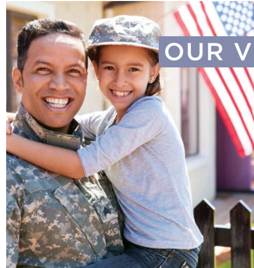
This talk corresponds with Tour 1—The Journey Home: Our Veterans Return on Tuesday, September 12 or Wednesday, September 13.